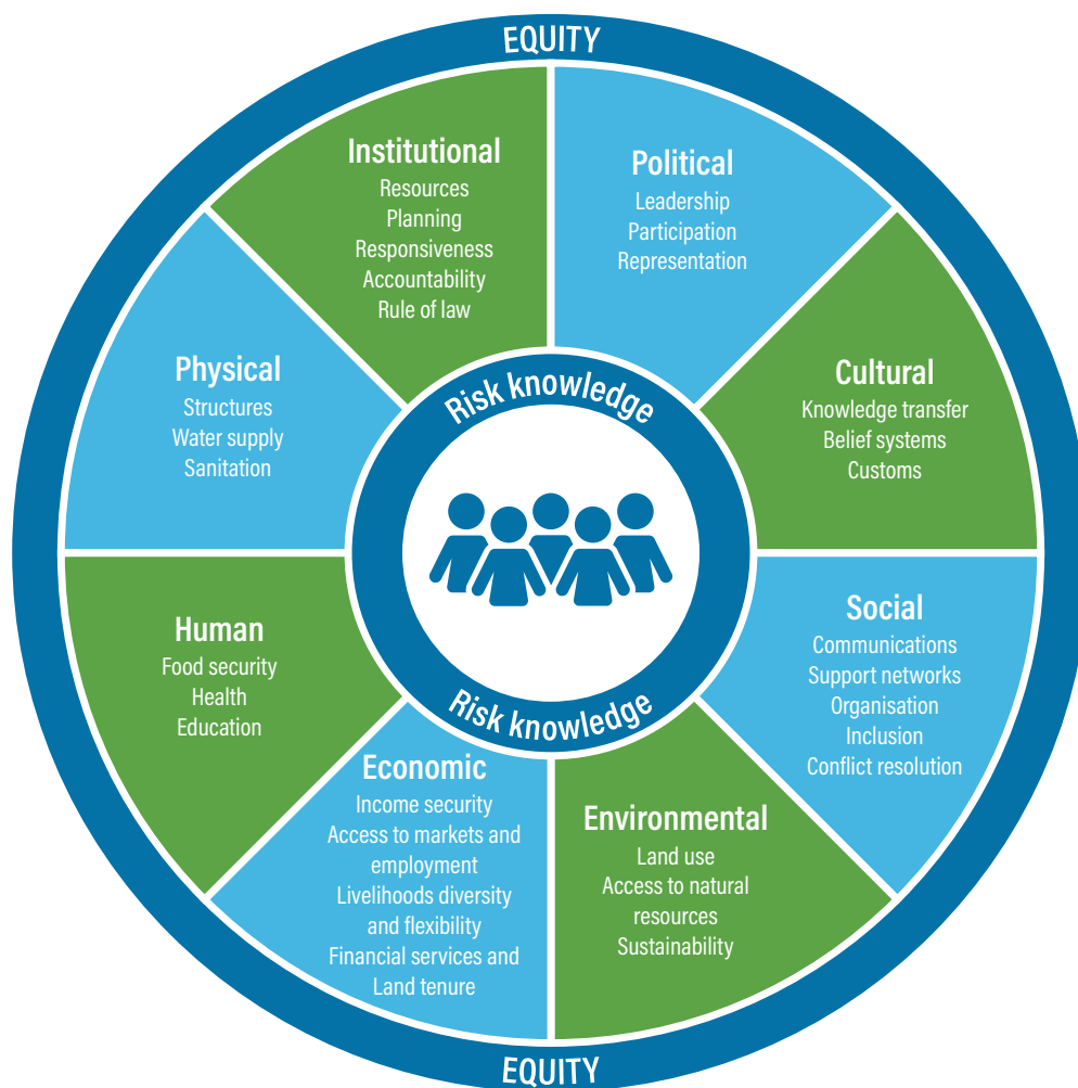
Figure 2: Factors influencing resilience 13

and risks that a community might face” (Peters et al. 2016) 12 . Resilience approaches do not distinguish between DRR and CCA. Building resilience requires not only effectively managing disaster shocks and climate impacts, but safeguarding and improving well-being in the face of ongoing risk. The framing of resilience resonates in the region, aligning with how the regional architecture has been structured in the FRDP and how some national governments, such as Vanuatu’s, are allocating funding tagged as “resilience” (Hallwright and Handmer, 2021). The FRDP highlights that to build resilience effectively, responses to climate change and disasters must consider a range of factors, as articulated in Figure 2.