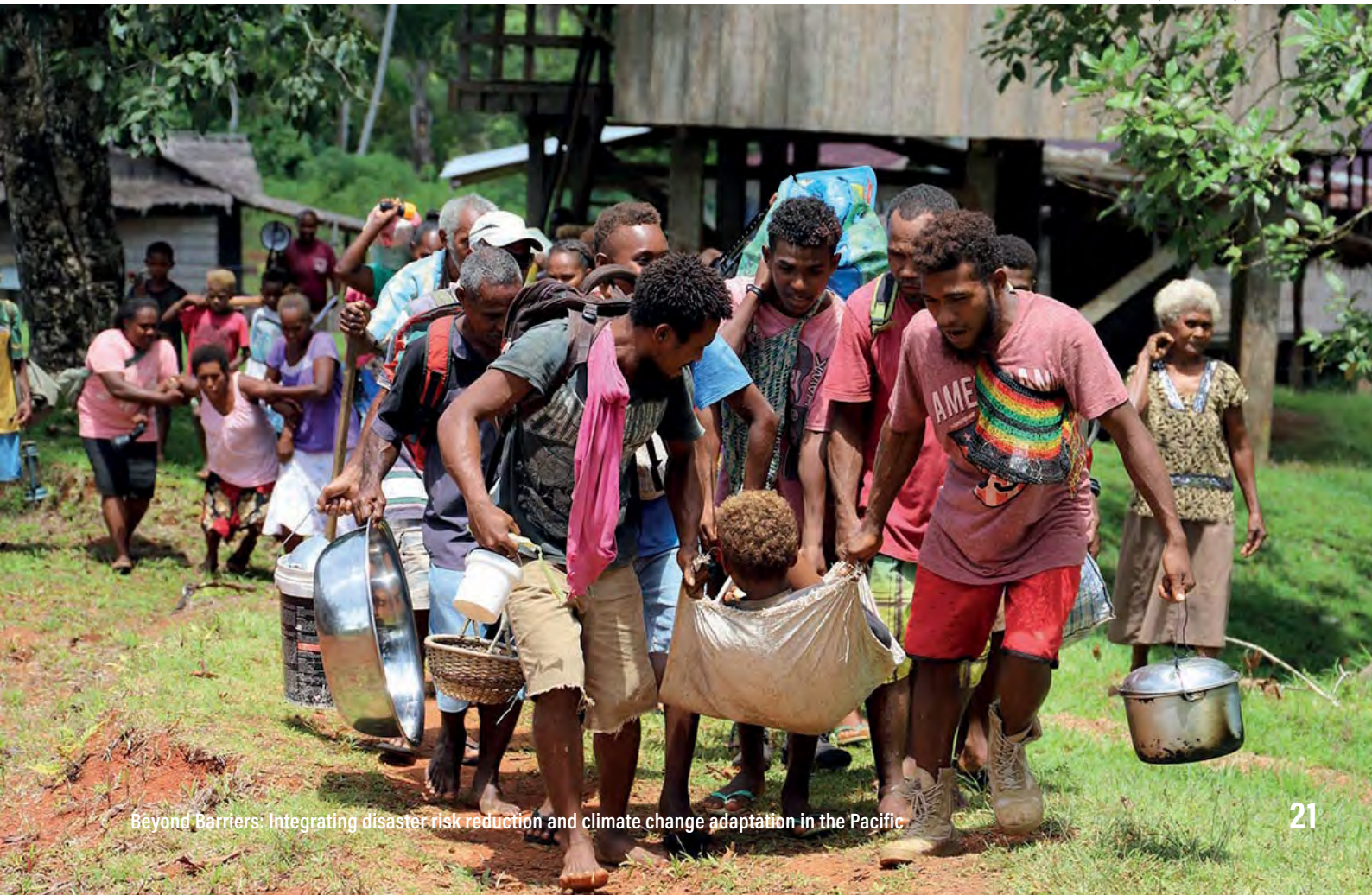
Solomon Islands evacuation simulation (Oxfam)

improving practices and avoiding negative impacts (Hay and Mimura 2013; Griffin NRM 2016). The development of accessible community-focused guidance and tools will encourage stronger engagement and help data and impact to be communicated in a way that is understood and owned by communities (Mercer et al. 2014; Moser and Ekstrom 2010; Natoli 2019). The importance of regular monitoring and reporting is emphasised in the FRDP; finding ways to ensure this process is streamlined and accessible to a wide range of stakeholders will be key to improving the accountability and effectiveness of integrated programming (SPC et al. 2020). There is also a significant opportunity to harmonize data collection and reporting efforts to ensure consistency and availability of data across the fields (Hay and Mimura 2013; Natoli 2019).