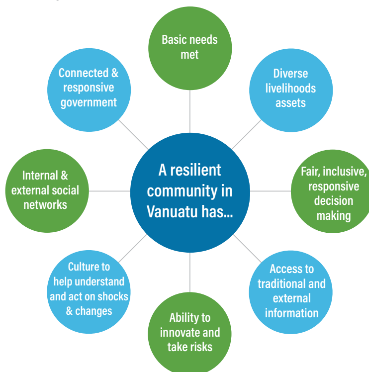
Figure 3: Vanuatu Community Resilience Framework

Figure 3 depicts the Vanuatu Community Resilience Framework.